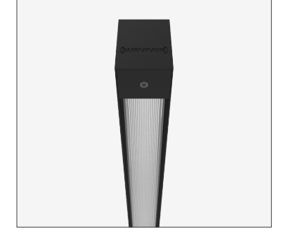
IK17 175 joules impact resistance

IP66 hermetically sealed light module cassette