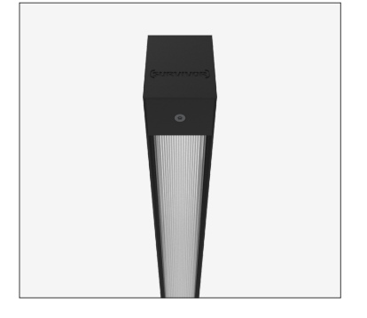
IK17 175 joules impact resistance

IP66 hermetically sealed light module cassette