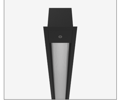
country of origin

custodial, public areas, and secure healthcare