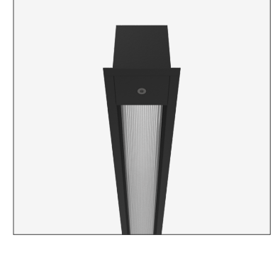
country of origin

custodial, public areas, and secure healthcare