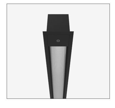
country of origin

custodial, public areas, and secure healthcare