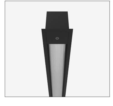
country of origin

custodial, public areas, and secure healthcare