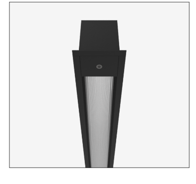
country of origin

custodial, public areas, and secure healthcare