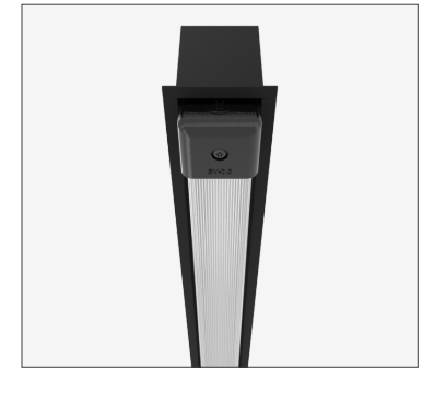
country of origin

custodial, public areas, and secure healthcare