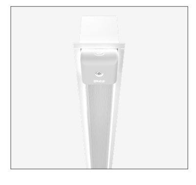
country of origin

custodial, public areas, and secure healthcare