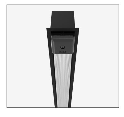
country of origin

custodial, public areas, and secure healthcare