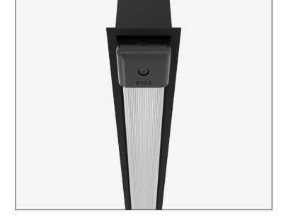
IK17 175 joules impact resistance

IP66 hermetically sealed light module cassette