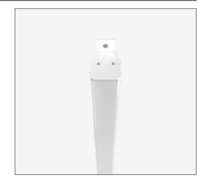
125 joules impact resistance hermetically sealed light module cassette security torx tamper-proof fasteners