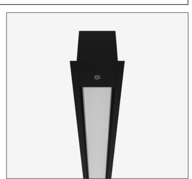
country of origin

AT06 security torx tamper-proof fasteners