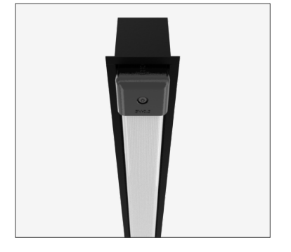
IK15 125 joules impact resistance

IP66 hermetically sealed light module cassette