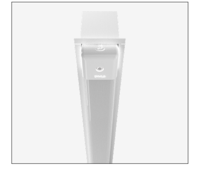
IK15 125 joules impact resistance

IP66 hermetically sealed light module cassette AT06 security torx tamper-proof fasteners