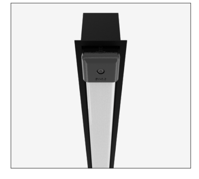
IK15 125 joules impact resistance