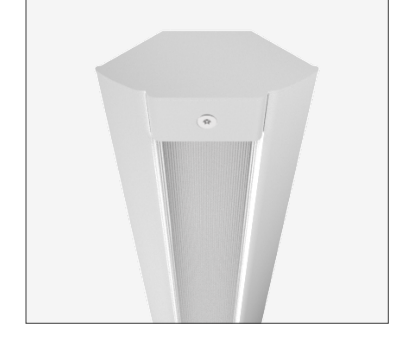
IK17 175 joules impact resistance