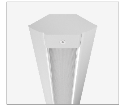
IK17 175 joules impact resistance