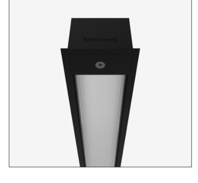
country of origin