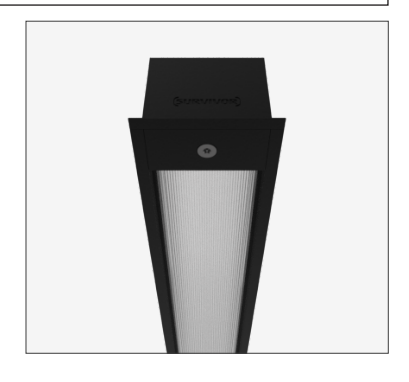
country of origin

AT06 security torx tamper-proof fasteners