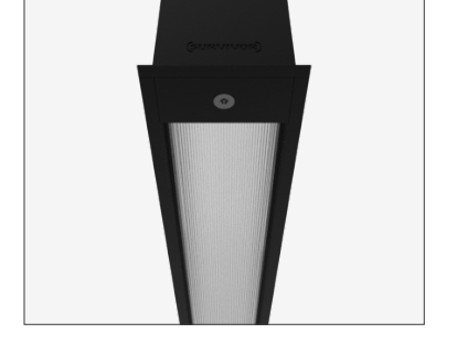
IK17 175 joules impact resistance