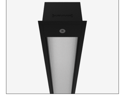
country of origin