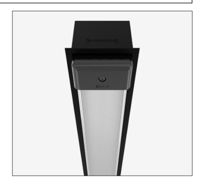
country of origin