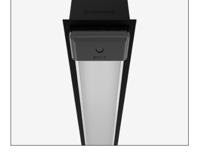
IK17 175 joules impact resistance

IP66 hermetically sealed light module cassette