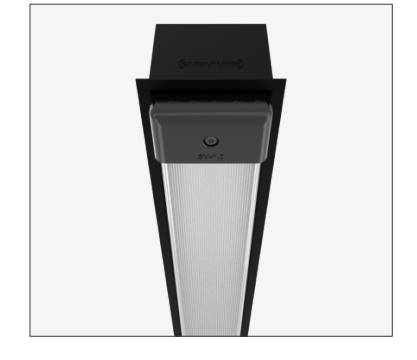
country of origin

AT06 security torx tamper-proof fasteners