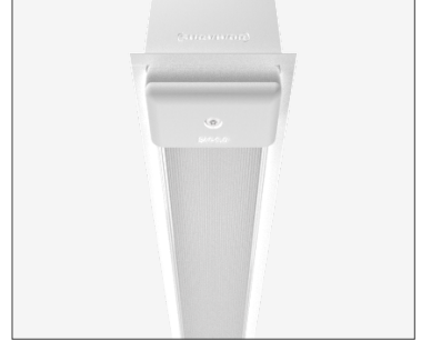
country of origin Australia