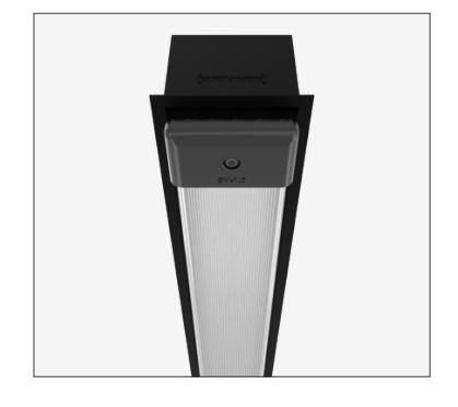
country of origin

AT06 security torx tamper-proof fasteners