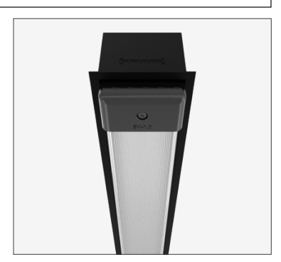
country of origin

AT06 security torx tamper-proof fasteners