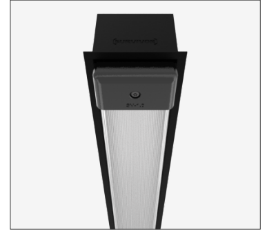
country of origin Australia