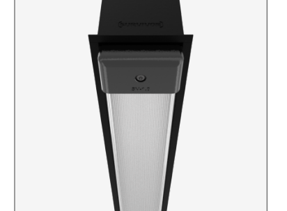
IK17 175 joules impact resistance

IP66 hermetically sealed light module cassette