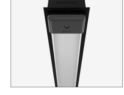
country of origin

AT06 security torx tamper-proof fasteners