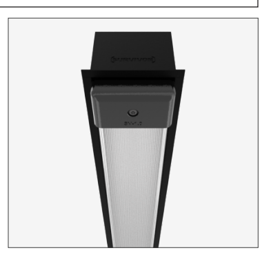
country of origin

AT06 security torx tamper-proof fasteners