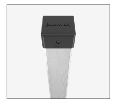
country of origin

custodial, public areas, and secure healthcare