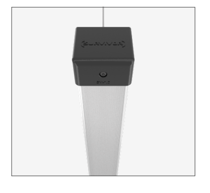
IK17 175 joules impact resistance

IP66 hermetically sealed light module cassette AT06 security torx tamper-proof fasteners