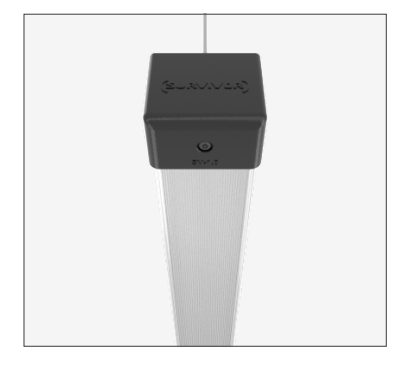
IK17 175 joules impact resistance

IP66 hermetically sealed light module cassette