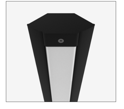
IP66 hermetically sealed light module cassette