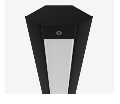
country of origin