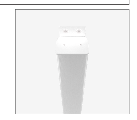
country of origin Australia