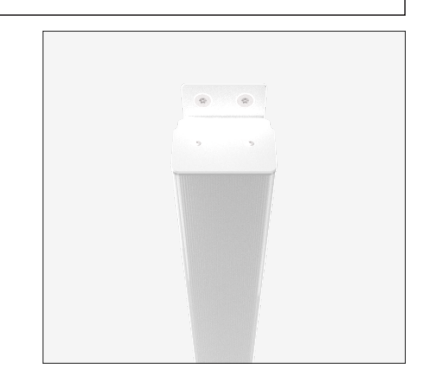
country of origin Australia