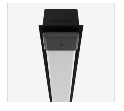
IK15 125 joules impact resistance

IP66 hermetically sealed light module cassette AT06 security torx tamper-proof fasteners