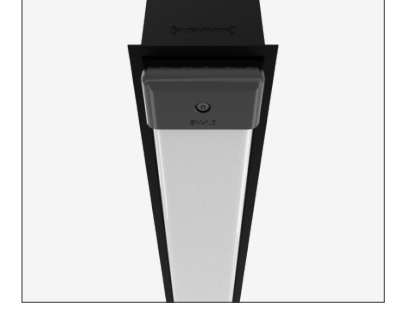
IK15 125 joules impact resistance