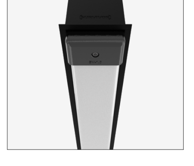
country of origin Australia